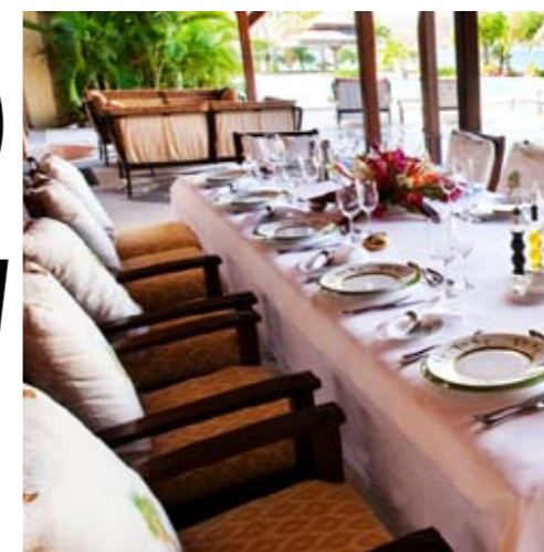
3- Sunset cocktails can stretch into romantic, moonlit dinners by candlelight.