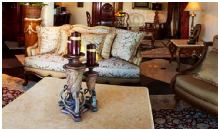
1- Careful attention is paid to every detail. 2- The interiors were designed by Oscar della Renta and Richard Frinier.